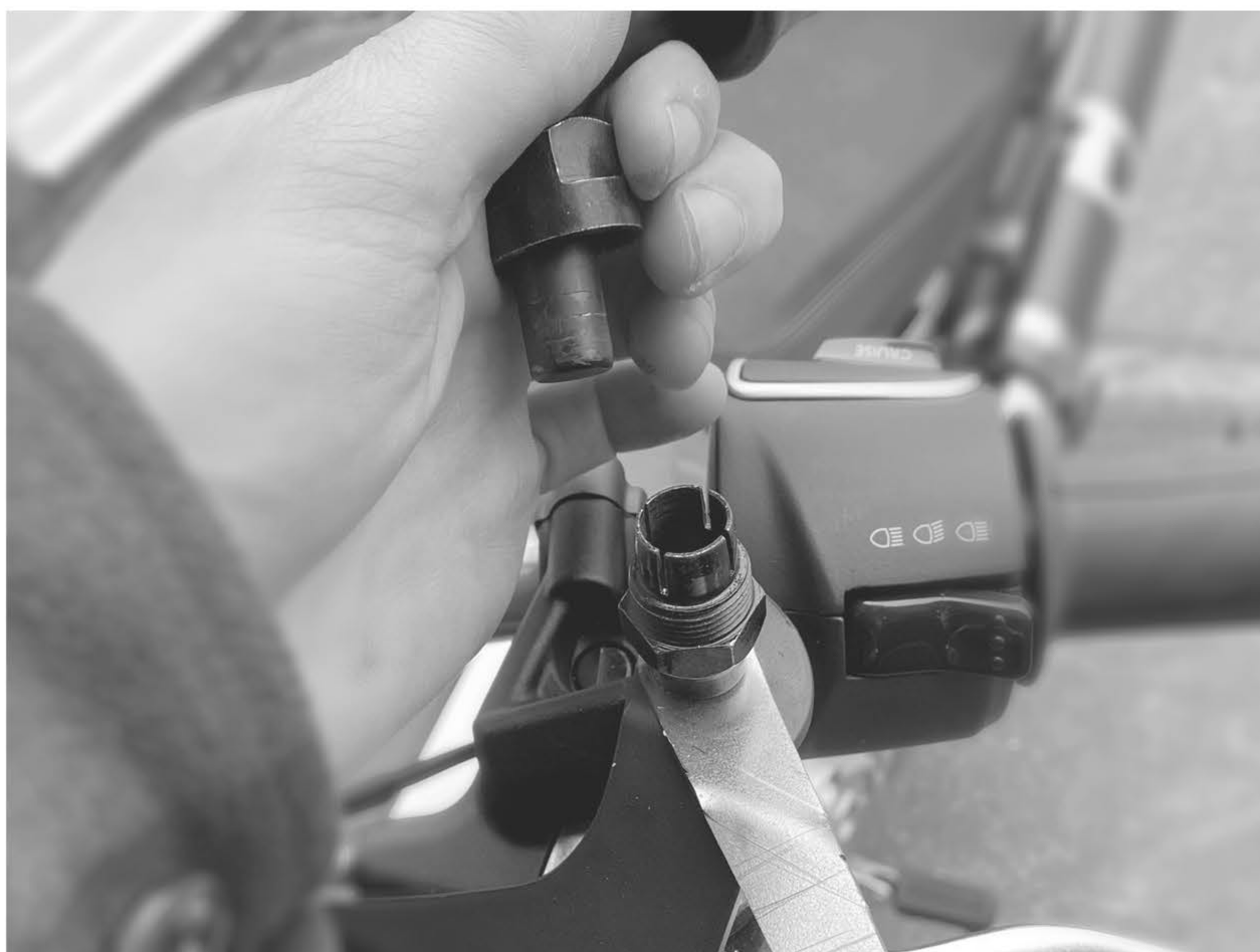
Fitting sequence for reassembly of the mirror mounting